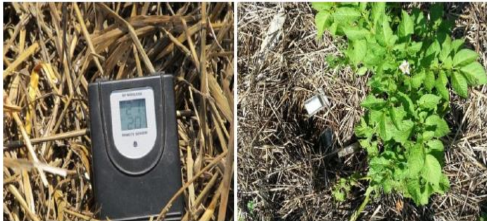
Figure 6. Placement of autonomous electronic temperature sensors on the experimental plots.

To monitor the soil temperature at the depth of the tubers in each experimental plot, autonomous electronic temperature sensors were installed that enabled to record temperatures throughout the day from the day of planting to a harvest day (Figure 6).