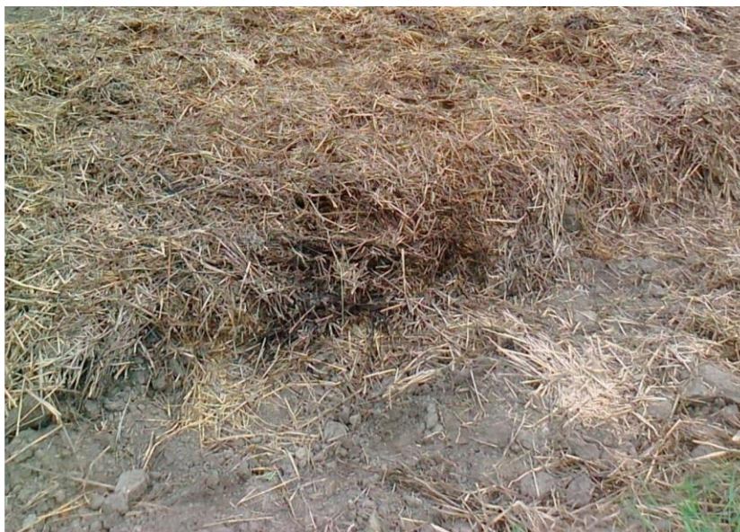
Figure 2. Covering planted potatoes with a layer of straw.

Thus, the analysis of the main components of the introduced energy-efficient environmentally friendly technology for growing potatoes on the surface of the field shows that its effectiveness depends primarily on the ability of the mulching straw layer to provide favorable temperature conditions for the formation of large yields of quality potatoes. The straw of cereal crops is the most reasonable mulching material in modern production. Therefore, the basic parameter of controlling the process of forming the temperature under the straw layer is its thickness. The most reliable justification of the required straw mulch for specific production conditions can be simulated by the temperature dependence of the biodynamic system "air – straw mulch – surface soil layer".