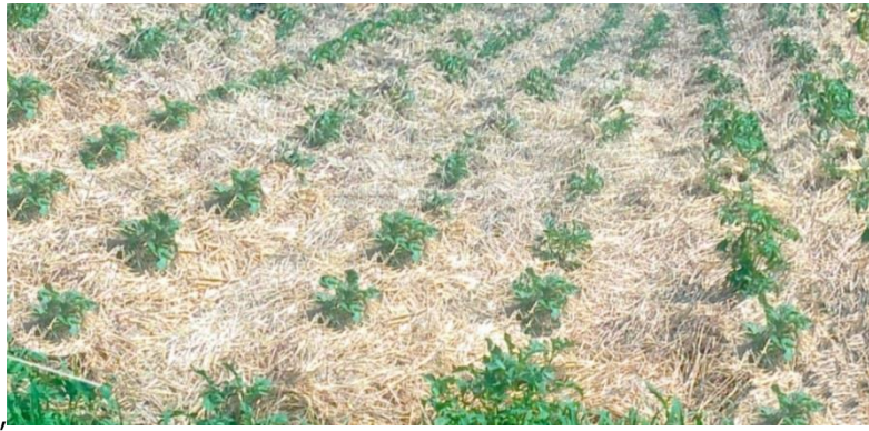
Figure 3. Germination of potato buds through a layer of straw.