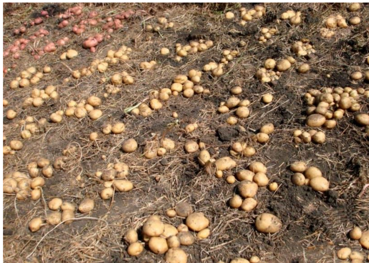
Figure 4. The plot before potato harvesting after removing the straw mulch.