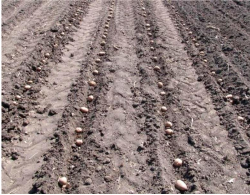
Figure 1. Planting potato tubers on the field surface.

saving, the exclusion of the described mechanized operations also reduces the number of MTU passes along the field, which results in a decrease in soil compaction and favorably affects the development of the plant root system.