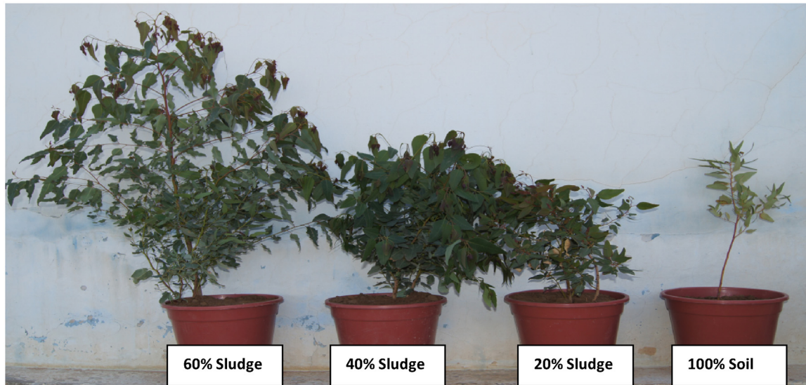
Fig. 1. Size of Eucalyptus camaldulensis after six months growth period for the different concentrations of sludge in substrate (Photos taken in October 2015).

in mixtures. Largest plants to be recorded were grown on the mixture with 60% sludge (Fig. 1).