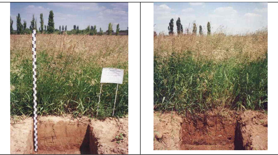
Loess loam Mix of Red-Brown Loam and Clay

Fig. 2. Artificial Profiles of Rocks after Long-Term Plant Melioration