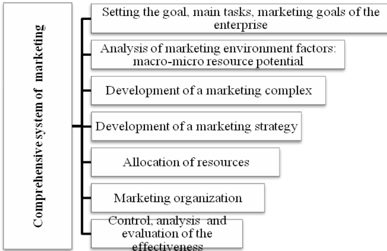
Figure 3.2 Components of the complex system of agrarian marketing of the enterprise

We are convinced that a complex marketing system is a combination of a marketing complex with a marketing management system (Figure 3.2).