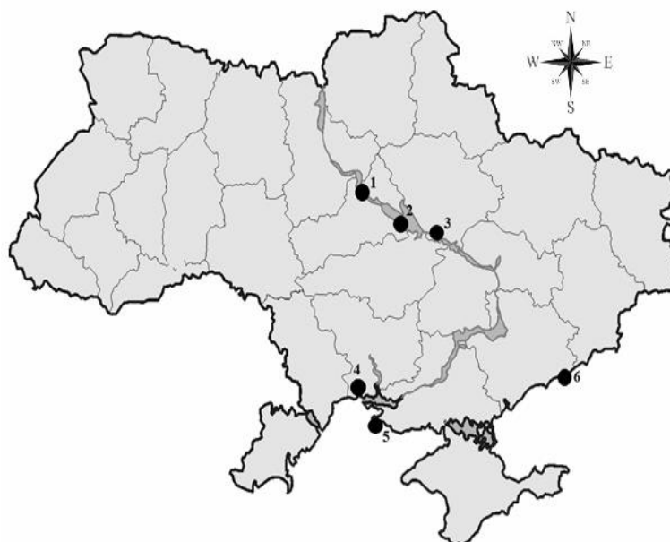
Figure 1. Schematic sampling locations of the black-striped pipefish in Ukraine.

Notes: 1 – Kremenchug reservoir, stream part; 2 – Kremenchug reservoir, lacustrine part; 3 – Dneprodzerzhinsk reservoir; 4 – Berezansky estuary; 5 – Tendrovsky Bay; 6 – Berdyansk Spit. Note: The sampling points 4–6 – by (Movchan, 1988)